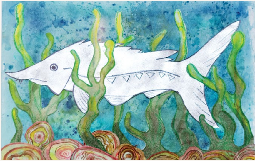
Calming art centered around the theme of Lake Superior helps craft the clinic atmosphere. See pages 12-13.