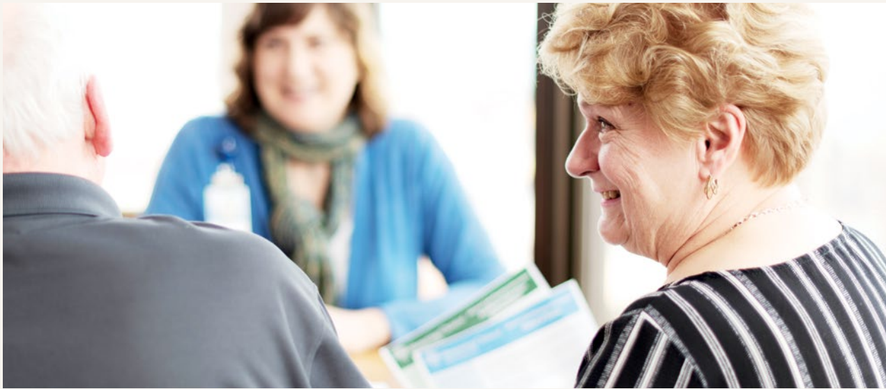
Healthcare directives help honor patient choices. See pages 8-9.