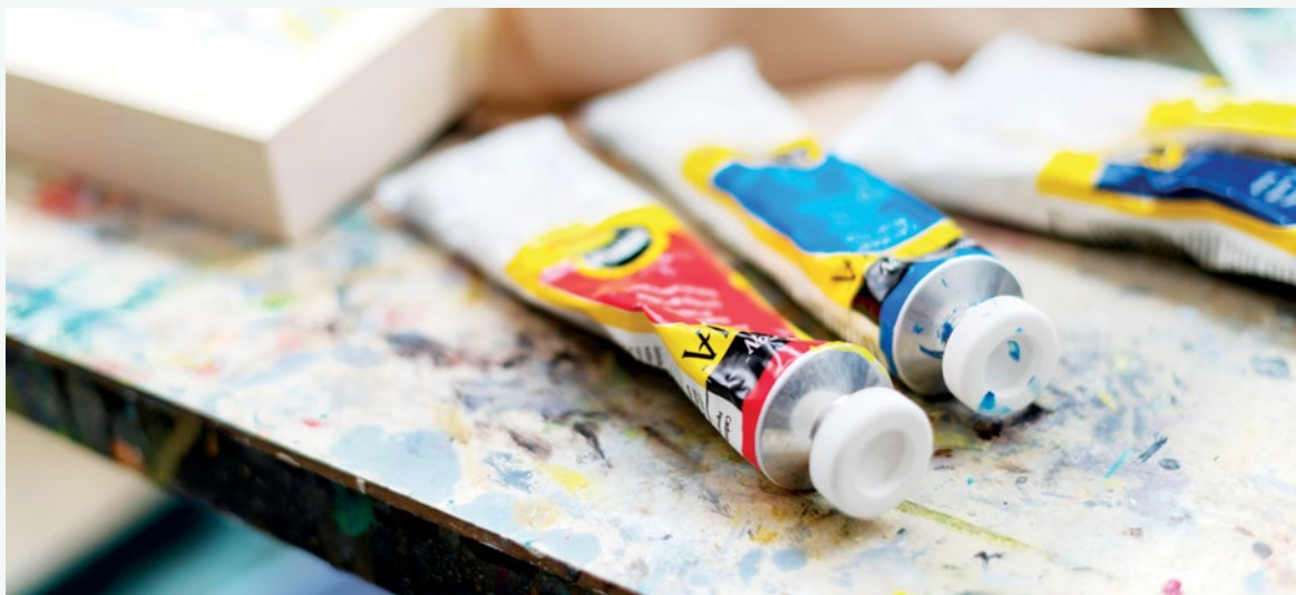
Art in the Clinic. Read more on pages 12-13.