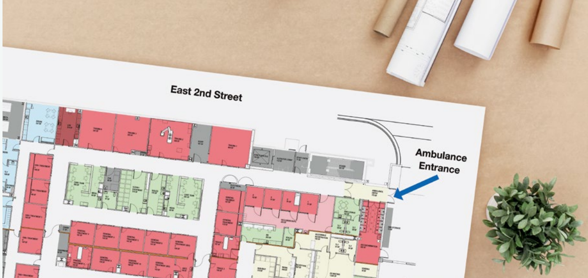
Planning for the future. Read more on pages 2-3.